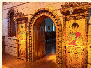
Pictured is the Narthex of St Demetrios' Chapel, at St Anthony's Monastery, Florence, AZ

As we enter church, we are found in the “Narthex” section of the church. The purpose of the Narthex is to allow the faithful to transition from the world of our society into the world of God’s Kingdom. Candles are lit to represent that, as Christ is the Light of the World, we who follow Christ are also the light of the world. In addition, the candles represent an offering of our prayers to God. We venerate icons of our patron saint and/or the Holy Theotokos, as we also make the Sign of the Cross.